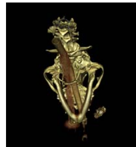
3D Image of the Skull

Thursday, April 28 th Registration 6:00-6:30pm Dinner 6:30-7pm Lecture 7pm